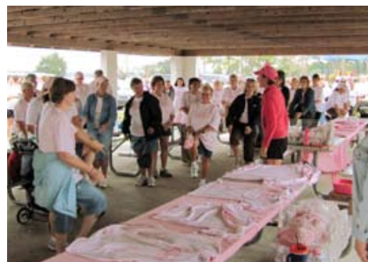
Participants in last year's Breast Cancer Awareness Walk warm up.

Where: LWMC Hunt Building, 2nd floor meeting room