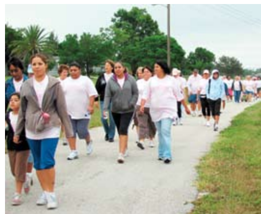
Participants enjoy last year's walk.